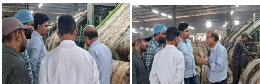
Skill programme for TG 2 under NTTM (Skilling) at Bowreah Jute Mills – Theory & Practical