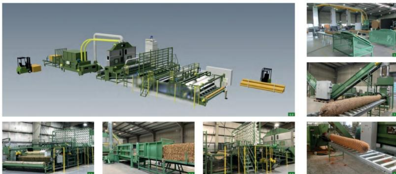
Common Facility Center- Stitch Bonding Non-Woven Plant

This hub transforms jute from a traditional packaging material into a modern economic driver, positioning Indian natural fibers on the global stage of environmental engineering.