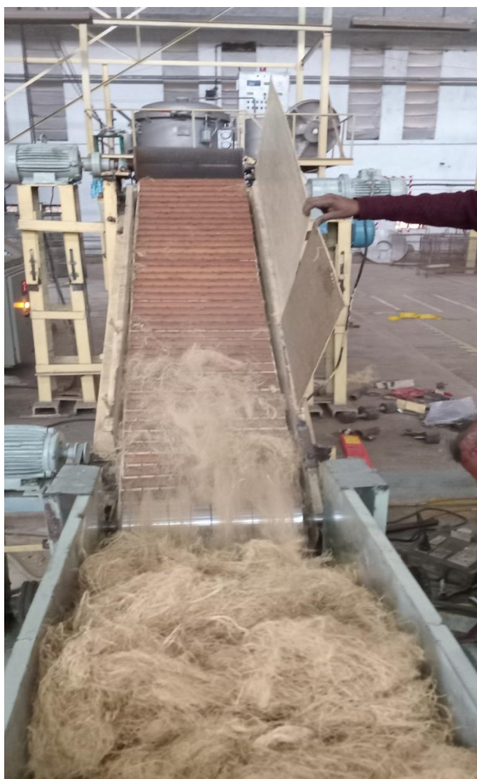
Auto Feeder of Bamboo Fiber to Fiber Opener

By placing high-capacity, automated technology in the hands of local clusters, IJIRA is bridging the "valley of death" between research and rural prosperity.