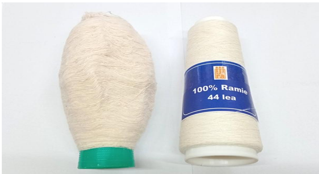
Hand Spun Vs. Ring Spun Yarn

By bridging the gap between biotechnology and traditional textiles, IJIRA is ensuring that Ramie isn't just the strongest natural fiber—it's the smartest business choice for a sustainable 2026.