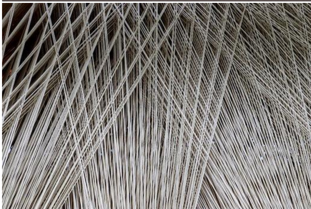
Jute-Ramie-Viscose Blended Yarn